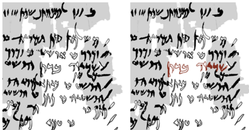
Figure 1. Left: Illustration of Cowley-22, by Jasmin G. Rappeye, based on the drawing by Ada Yardeni in Textbook of Aramaic Documents 3:227 and foldout 32. Right: Same image, with śryh brt , “Seraiah (Sariah) daughter of,” highlighted. The “hollow strokes” used to represent the restored portions indicate that the restorations are considered “nearly certain.”

a daughter, not a son.” 7 In the most recently published translation and transcription of this papyrus, Bezalel Porten and Ada Yardeni would seem to agree. In their hand-drawing of the Cowley-22 papyrus (see Figure 1), 8 they represented the restoration of the final hē (ה) in ŚRYH and the bet-res (בר) of brt as being “nearly certain.” 9