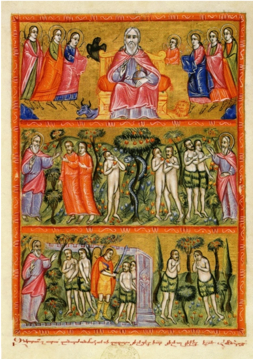
Figure 1. The Expulsion of Adam and Eve , 1646.