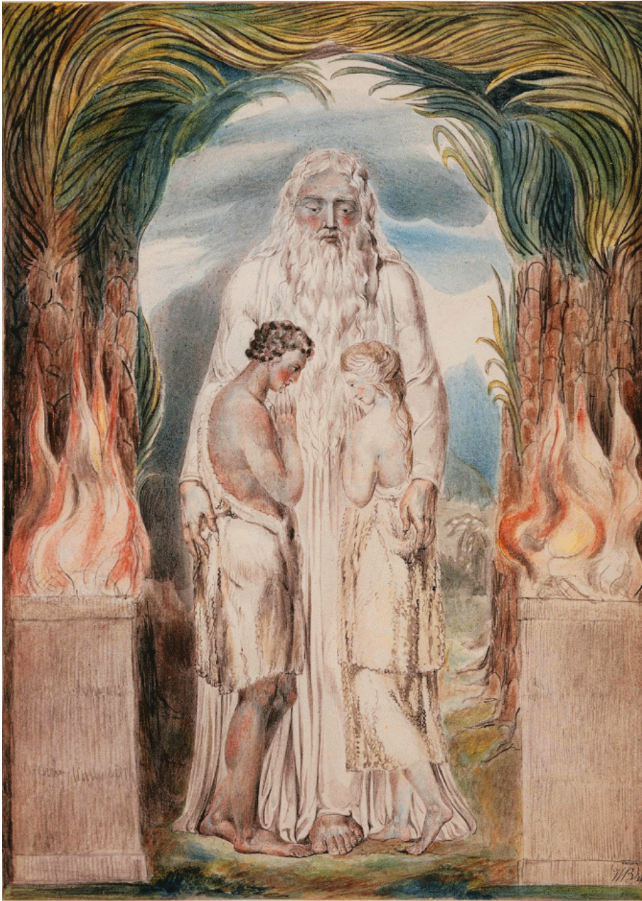
Figure 4. William Blake, 1757-1827: The Clothing of Adam and Eve, 1803.