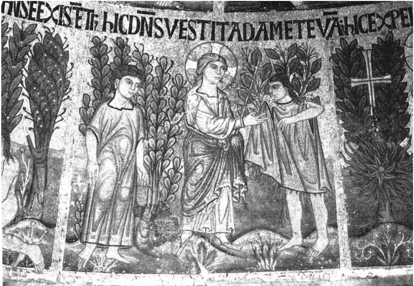
Figure 3. God Dressing Adam and Eve, 13th century.

Adam was powerless except through death to rid himself of the mortal flesh he had now put on. However, while still in this life, he was enabled to “[put] off the natural man and [become] a saint through the atonement of Christ” so that he could be found “blameless in the sight of God.” [28] When Adam asked why “men must repent and be baptized,” the Lord replied: “Behold I have forgiven thee thy transgression in the Garden of Eden.” [29]