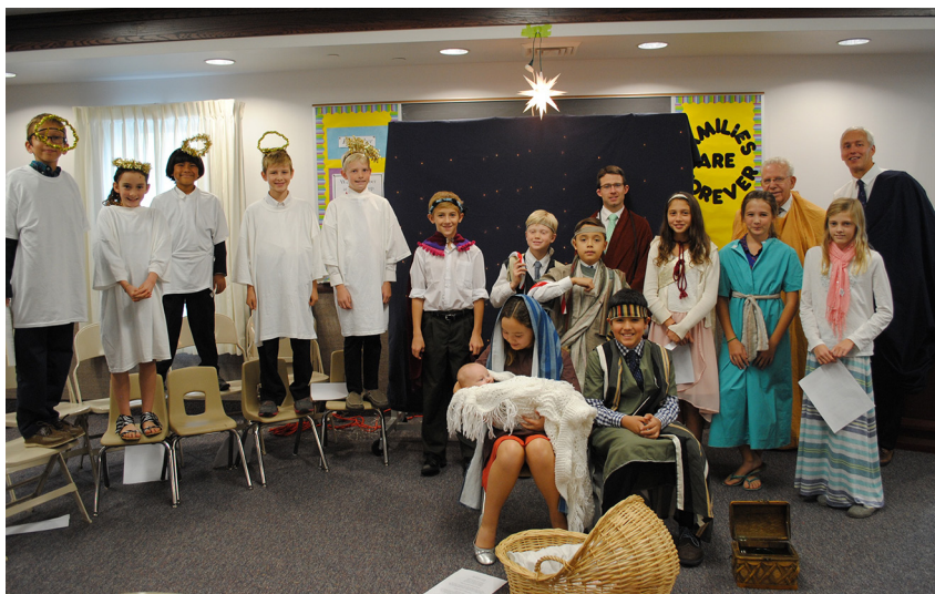
Figure 4. Halos slightly askew, bathrobes dutifully donned, and a real baby, this senior Primary nativity reenactment may not have been uniformly reverent or completely scripturally accurate, but it helped write the story of Christ's birth into our memories in ways a simple reading cannot.

become as dear and familiar to us as those of the Nativity. While the Nativity inspires tenderness and introduces a vulnerable God into the human world, the descensus can show us the redeeming and heroic Christ who breaks the bands of death and proclaims liberty to the captive. With plays such as this, we can see the end from the beginning and glimpse his great majesty and his compassion for us all.