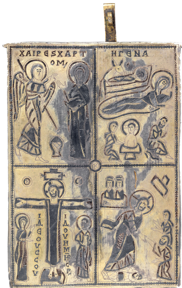
Figure 2. An Anastasis scene in miniature, about one inch by two inches. It occupies the lower right-hand corner on the inside lid of a ninth-century reliquary, a small, enameled box meant to hold remnants of the True Cross. The Fieschi-Morgan Staurotheke is in New York at the Metropolitan Museum of Art and is thought to have been made for private use in Byzantium during the time of iconoclasm.

The earliest remaining art with the words The Anastasis associated with Christ's Holy Saturday descent is a ninth-century Byzantine psalter, or a book of psalms. 55 Such small, privately held objects escaped the iconoclasts' wrath even in Byzantium and apparently continued to