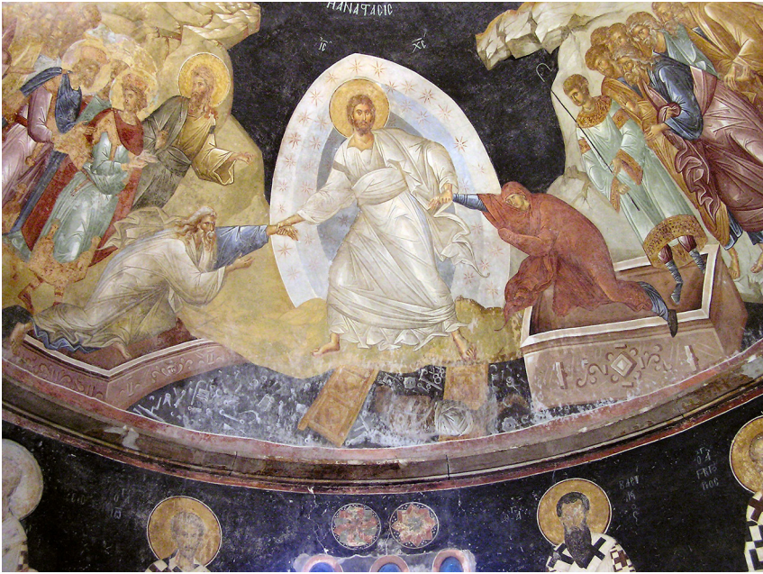
Figure 1. The great emblem of Easter for 300 million Orthodox Christians and others, the Anastasis, shows Christ's rescue of Adam and Eve shortly after his Crucifixion. This early fourteenth-century fresco is the centerpiece of a side chapel of the Chora Church (now Kariye Mosque) in Istanbul.

The descensus was familiar to early Christians. Works written by or attributed to Melito of Sardis, Clement of Alexandria, and Hippolytus of Rome speak of it as part of Christ's redemptive mission. Tertullian rails against the belief. The Odes of Solomon (written between 70 and 120 CE), the Epistle of the Apostles (second century), and The Shepherd of Hermas (written before 150 CE) refer to the descensus and use it to preach and to expound doctrine. Other works also refer to it. 5